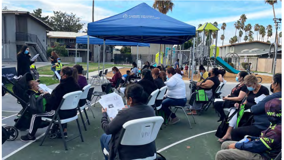
Community members attend a recent “SCC Prepared” workshop in San Jose.

In 2021, the agency began holding the “SCC Prepared” workshops in Spanish, Vietnamese, and English to residents of under-resourced neighborhoods in Santa Clara County’s East San Jose, Morgan Hill, Gilroy, and Mountain View. These areas are diverse, home to thousands of low-income residents living in high-density housing, and at high risk for power outages, house fires, and wildfires. Funding for the trainings is provided through