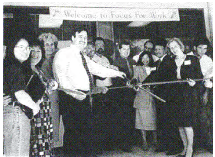
Catholic Charities' program staff were joined by elected officials and other guests at the ribbon cutting celebration of the opening of the Focus For Work Gilroy branch office in 1994.

Our vision for the future calls for us to implement new solutions to the root causes of poverty and engage with our communities and partners. We are transforming through innovation as we continue to walk with families and individuals on their unique journeys of hope and opportunity. ■