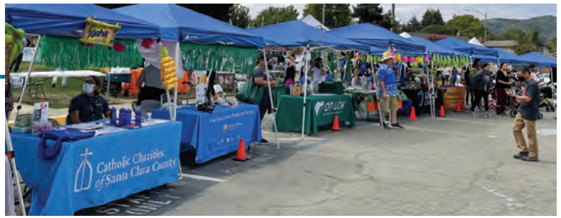
Catholic Charities joined other organizations at the Ohana Health Fair, Glen View Elementary in Gilroy in August.

While our Immigration Legal Services program has served South County residents through Catholic Charities' San Jose office since its accreditation in 1976, a Gilroy branch was opened and accredited in 1988 plus a second location in 2019. Catholic Charities' staff help individuals understand immigration laws and their rights under the law. We assist clients on a sliding-scale fee basis in residency documentation, applying for family reunification, applying for citizenship and other legal processes.